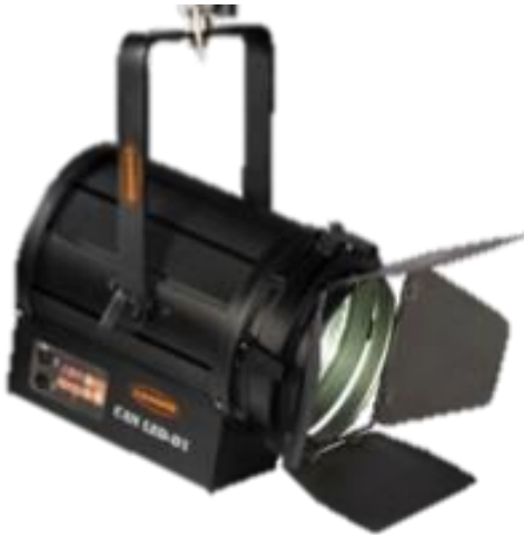
MODEL : CAN LED-D

Canara Fresnel equipped with an enhanced COB LED source providing a higher output with a significant efficiency, this 200 mm Fresnel lens presents an exceptional flat and variable beam angle with very wide opening, combined with an electronic flicker-free dimmable power supply unit to create a powerful yet economical LED wash & Spotlight make it the perfect choice for theatre, Auditoriums, TV studio, Production House, event and architectural applications.