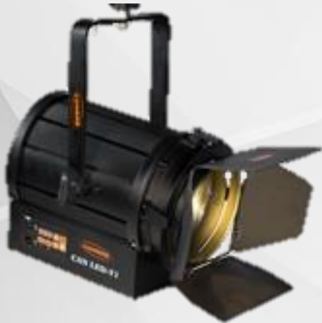
MODEL : CAN LED-T

Canara Fresnel equipped with an enhanced COB LED source providing a higher output with a significant efficiency, this 200 mm Fresnel lens presents an exceptional flat and variable beam angle with very wide opening, combined with an electronic flicker-free dimmable power supply unit to create a powerful yet economical LED wash & Spotlight make it the perfect choice for theatre, Auditoriums, TV studio, Production House, event and architectural applications.