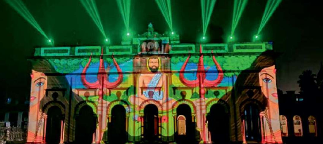
3D PROJECTION MAPPING